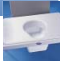
Extra-wide snap-on seat with hygienic opening.