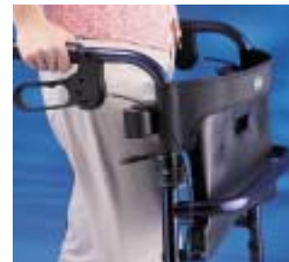
Flip-up seat allows user to step inside the frame.