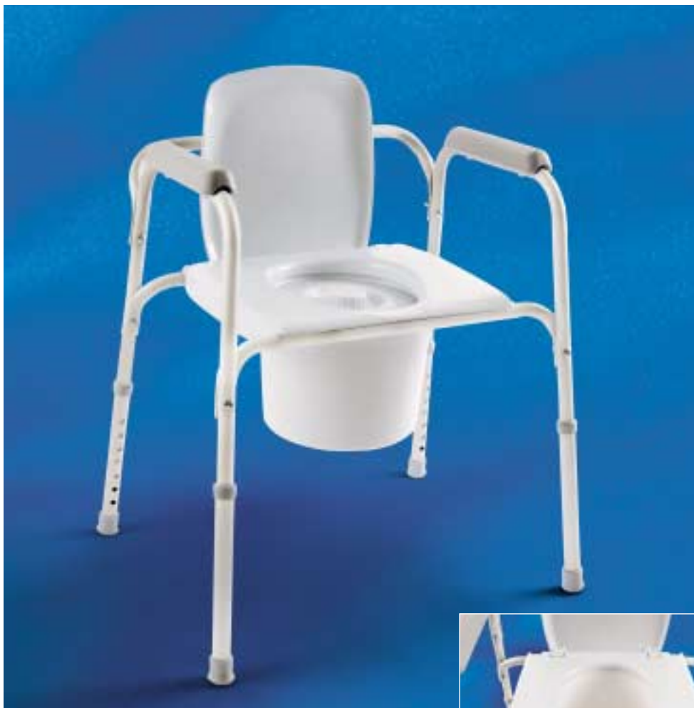
Invacare® All-In-One Aluminum Commode NEW Model no. 9650-4

Invacare's new All-in-One Aluminum Commode offers consumers the comfort and stability they need. The lightweight aluminum frame will not rust. With its 16-inch wide seat, consumers gain additional comfort and support. The Invacare All-in-One Aluminum Commode can be used bedside, or with backrest removed can act as a toilet safety frame or raised toilet seat.