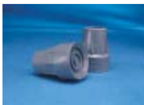
Model nos. 6134, 6135