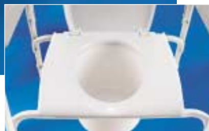
Large 16" wide snap-on seat for added comfort and support.