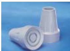
Model no. 6135